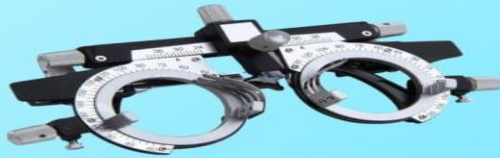
Trial frame lens